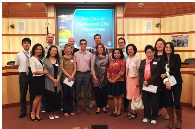
The high school counselors were greeted by the Mayor of Redwood City and toured key historical sites.

Applications for the 2016 workshop will be available January 2016.