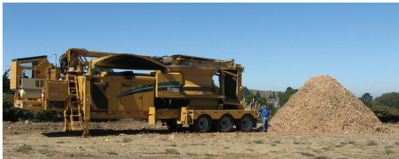
Monster size chipping machine and the large "mountain" of chippings.

of the winter break projects the Skyline Facilities Department is planning to undertake will be to take the chippings and spread them in parking lot medians, landscape areas, shoulders of the Loop Road and walkways, in 'mushy areas' between the main campus and Pacific Heights, in the Sharp Park median and various other locations. This promotes a better looking campus, deters weed growth, and conserves watering needs.