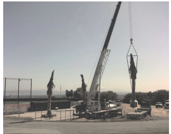
Written by Diane Martinez

The CSM Softball field was the last of the campus athletic facilities to be renovated. The new approach to the complex has a grand gated entrance off of the loop road which leads to a plaza area surrounded by three 20 foot canary date palms. The playing field, batting cages and warm-up area have been converted from natural to synthetic turf. The old field had a number of challenges to include parking accessibility, lack of restrooms and meeting spaces, inadequate spectator seating and no press or concession facilities. The new facility includes an entry to the field from parking lot 21, new dugouts, a press box and a team house building complete with restrooms, locker room, office and a snack shack. Before, there was only one set of bleachers for spectators to share. Now, home and visitor fans have their own seating. The Softball Field was the site for the Ribbon Cutting ceremony for the official completion of all the CSM Athletic Facilities on May 15, 2008. CSM engineers, groundskeepers, and custodians were instrumental in preparing the site for the ceremony which was a great success.