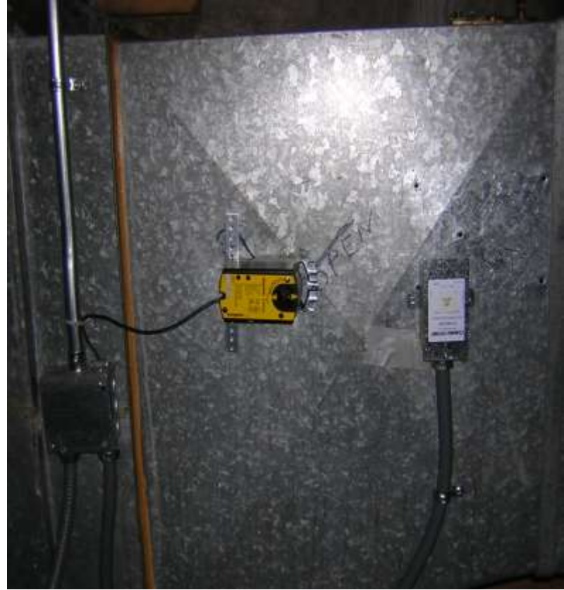
Pre & Post-Retrofit Damper Actuators