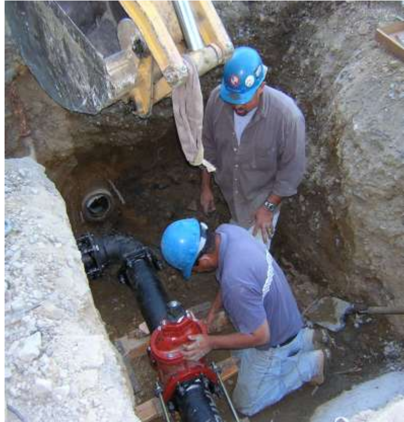
Piping repairs at CSM & Skyline College