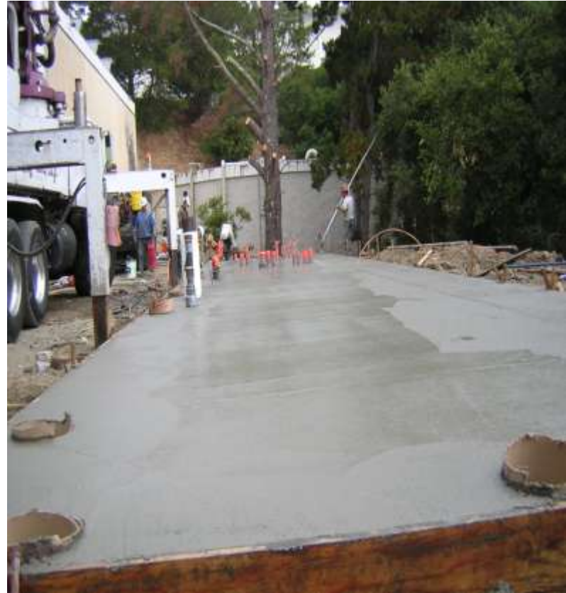
Concrete Pumping & Finished Concrete Pad - CSM