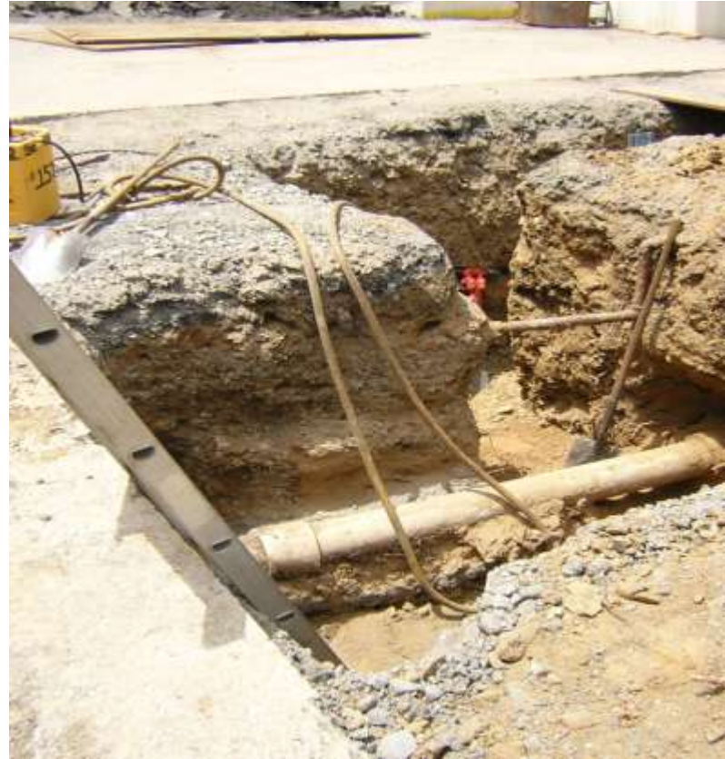
Damaged Piping at CSM & Skyline College