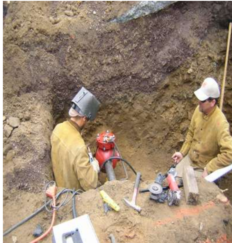
New Gas Line – Increased Pressure CSM