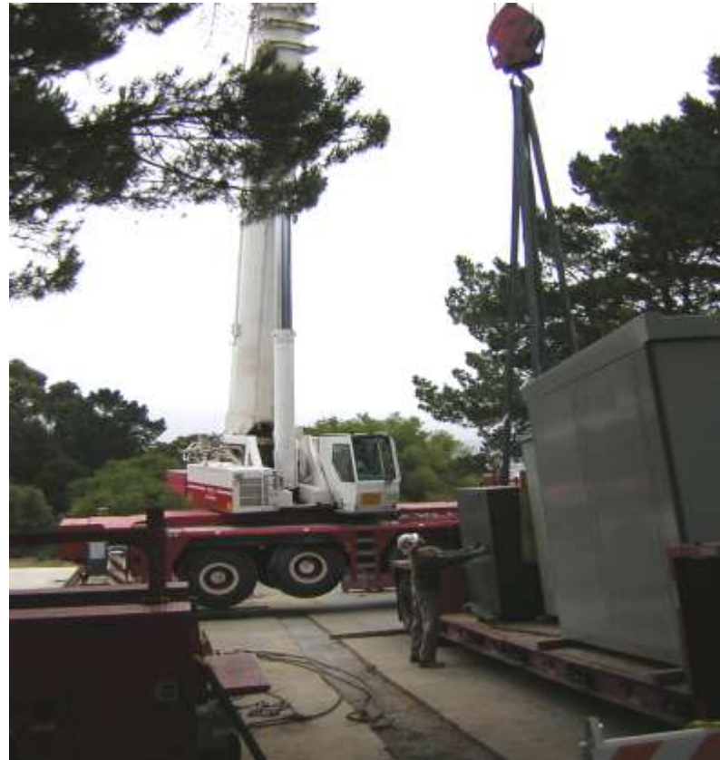
Co-gen Equipment Lift - CSM