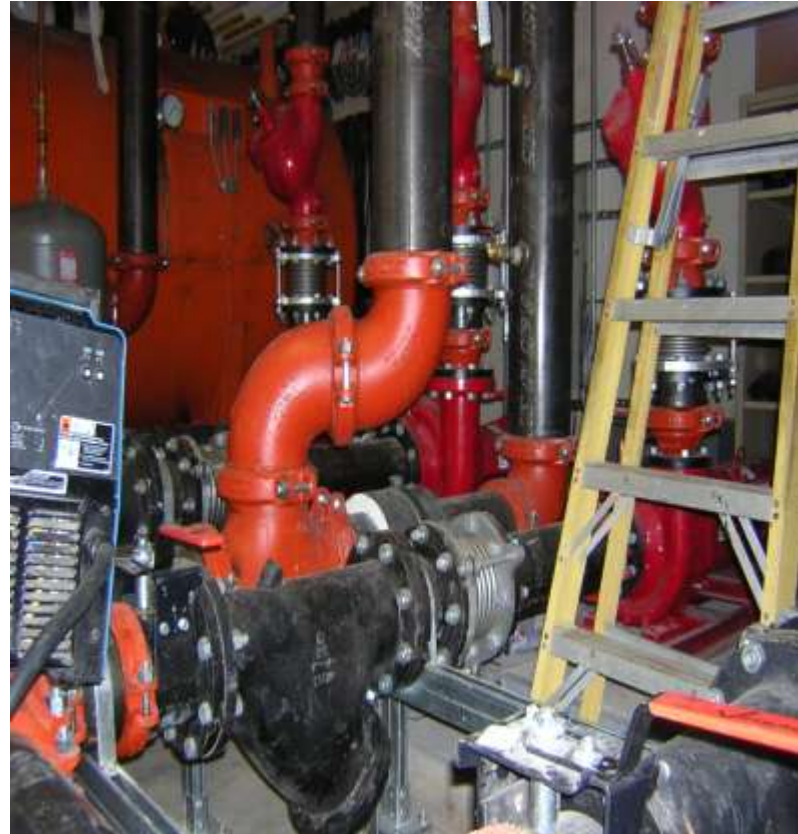
Pump retrofits at Canada College