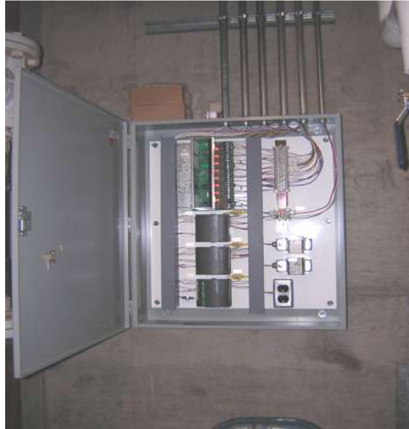
Pre & Post-Retrofit Control Panels