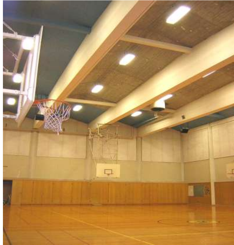
New Gymnasium Lighting – CSM