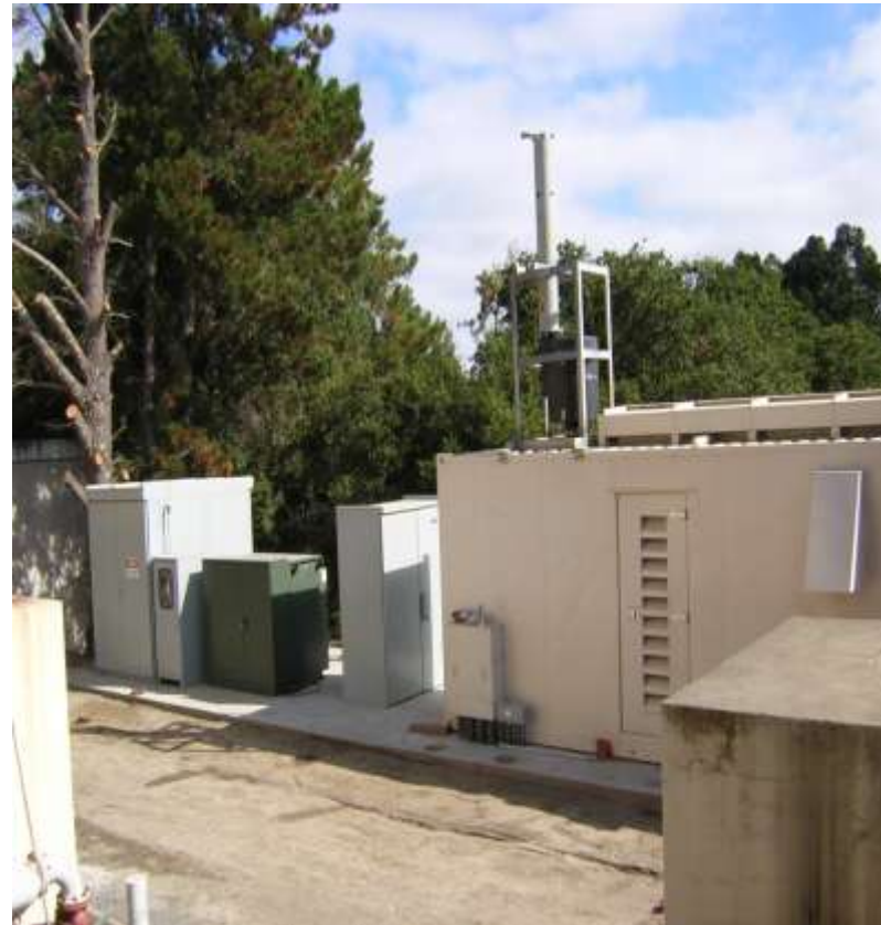
Co-gen Plant - CSM