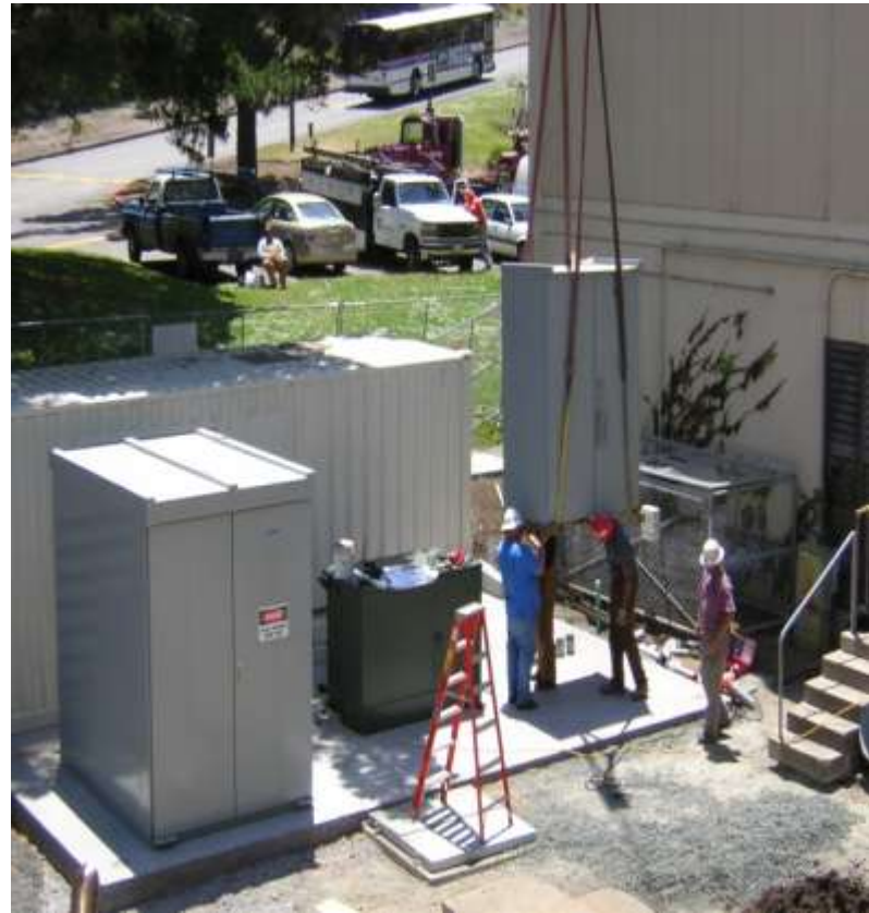
Cogen Equipment Lift – Skyline College