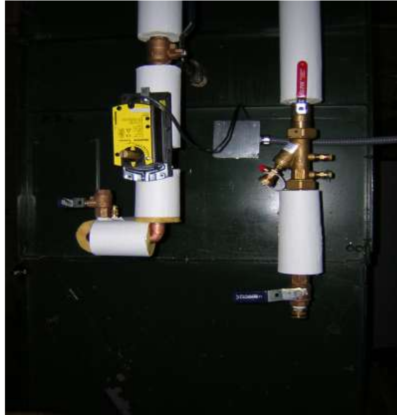
Pre & Post-Retrofit Piping