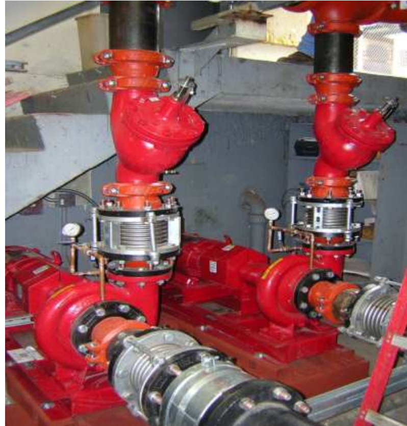
HHW System Conversion (Pumps) at Skyline College