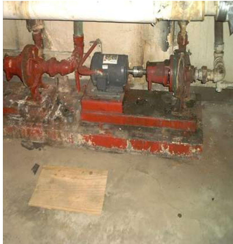
Existing pre-retrofit pumps