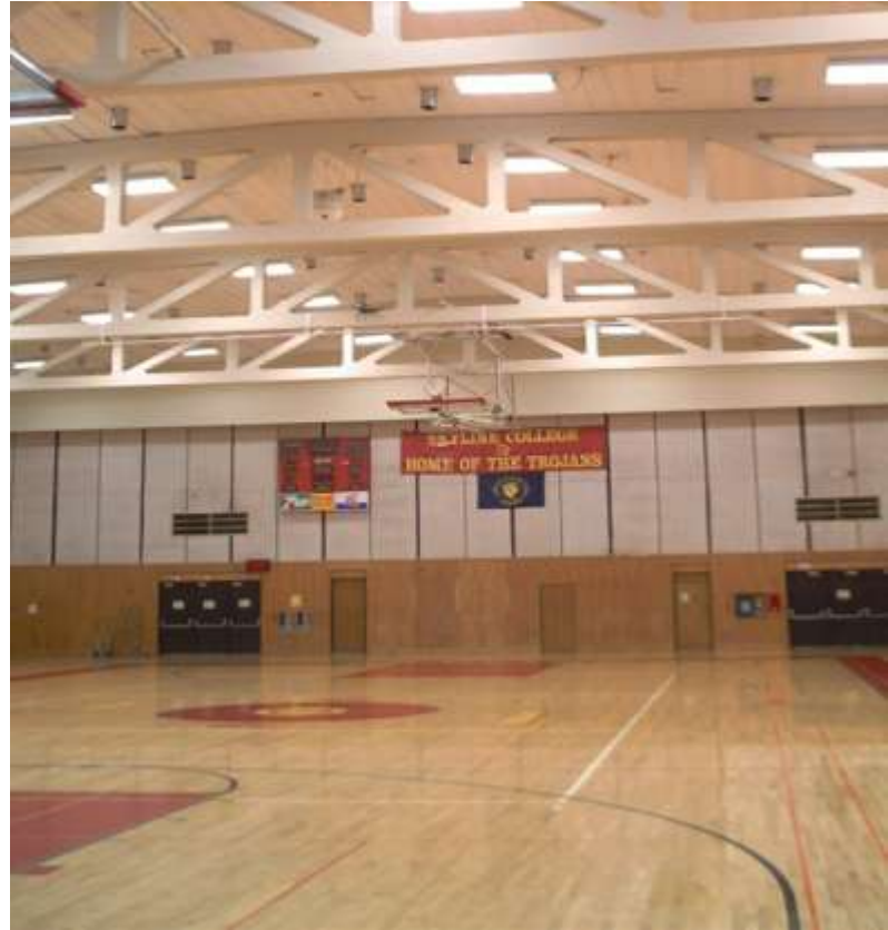
New Gymnasium Lighting – Skyline