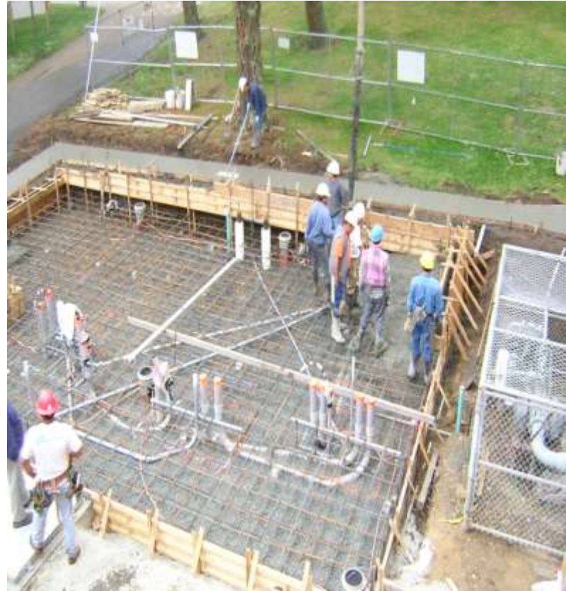
Cogen Pad Construction – Skyline College