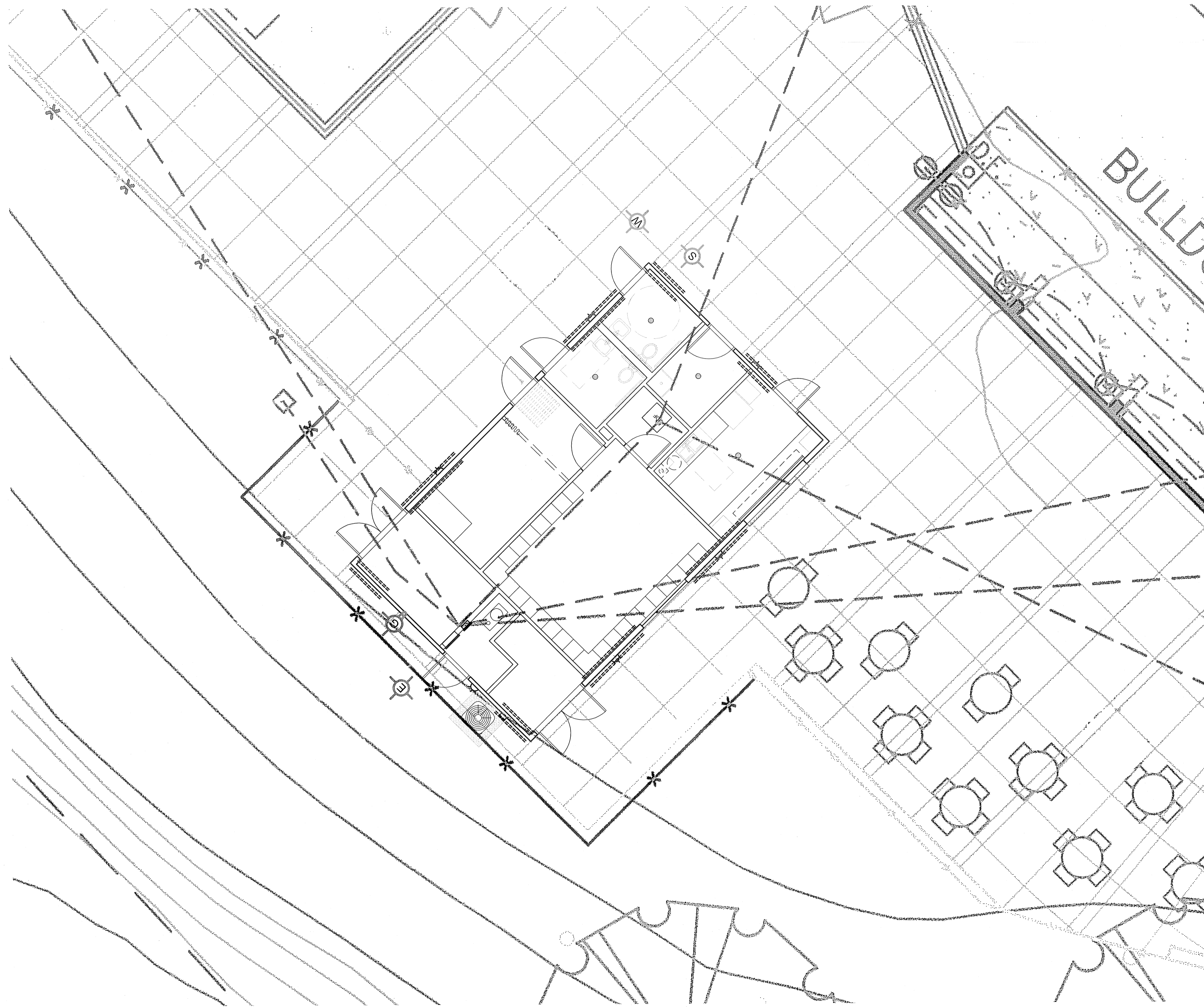
ELECTRICAL SITE PLAN - BUILDING A SCALE: 1" = 5'-0"