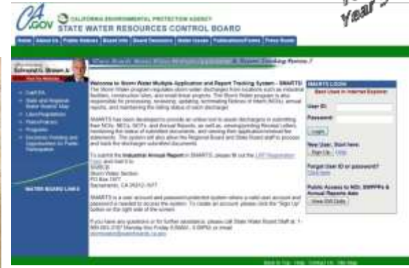
SMARTS Storm Water Multiple Application and Report Tracking System