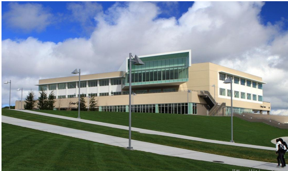
College of San Mateo Building 10 College Center