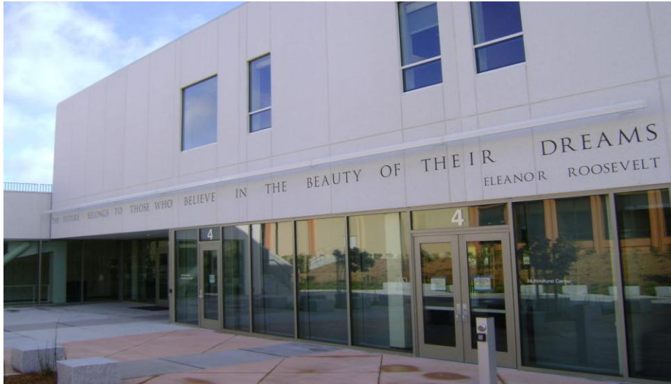
Skyline College Building 4 Multi-Cultural/Cosmetology