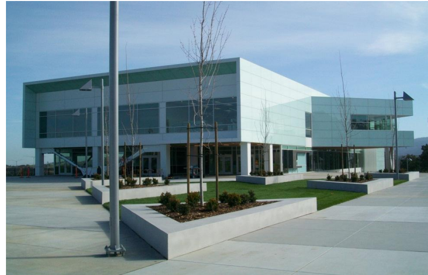
College of San Mateo Building 5 Health & Wellness