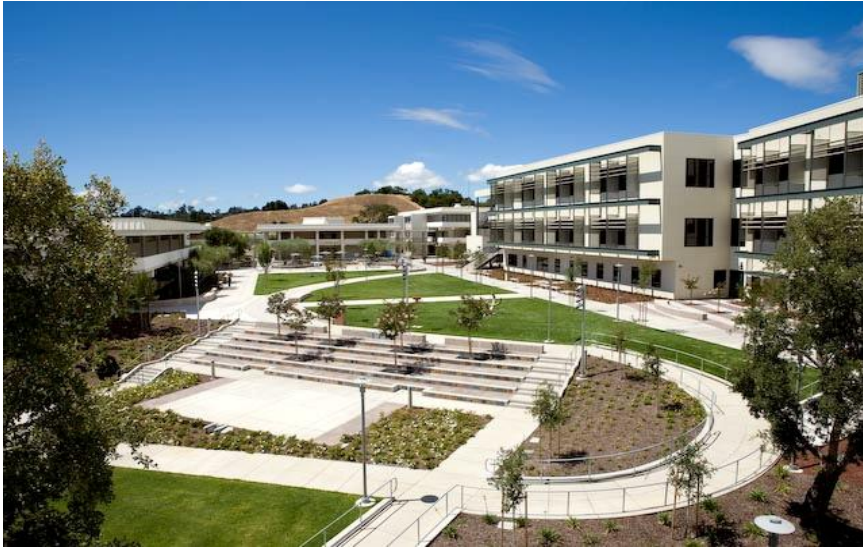
Cañada College Building 9 Library/Learning Resource Center