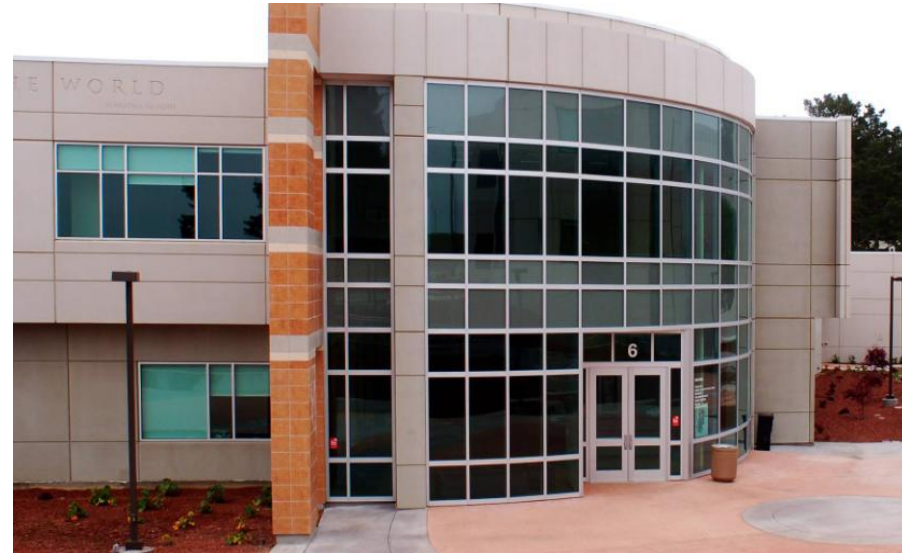
Skyline College Building 6 Student & Community Center