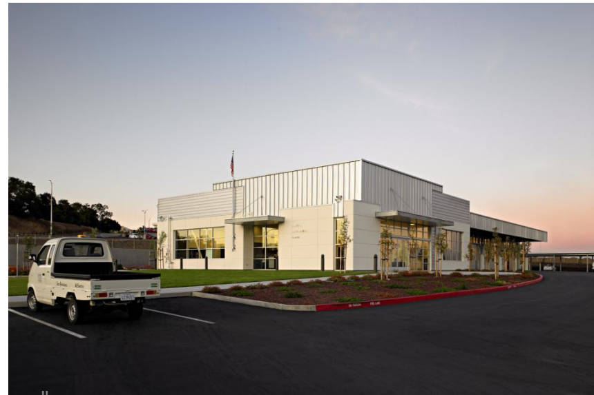
Cañada College Facilities Maintenance Center (FMC)