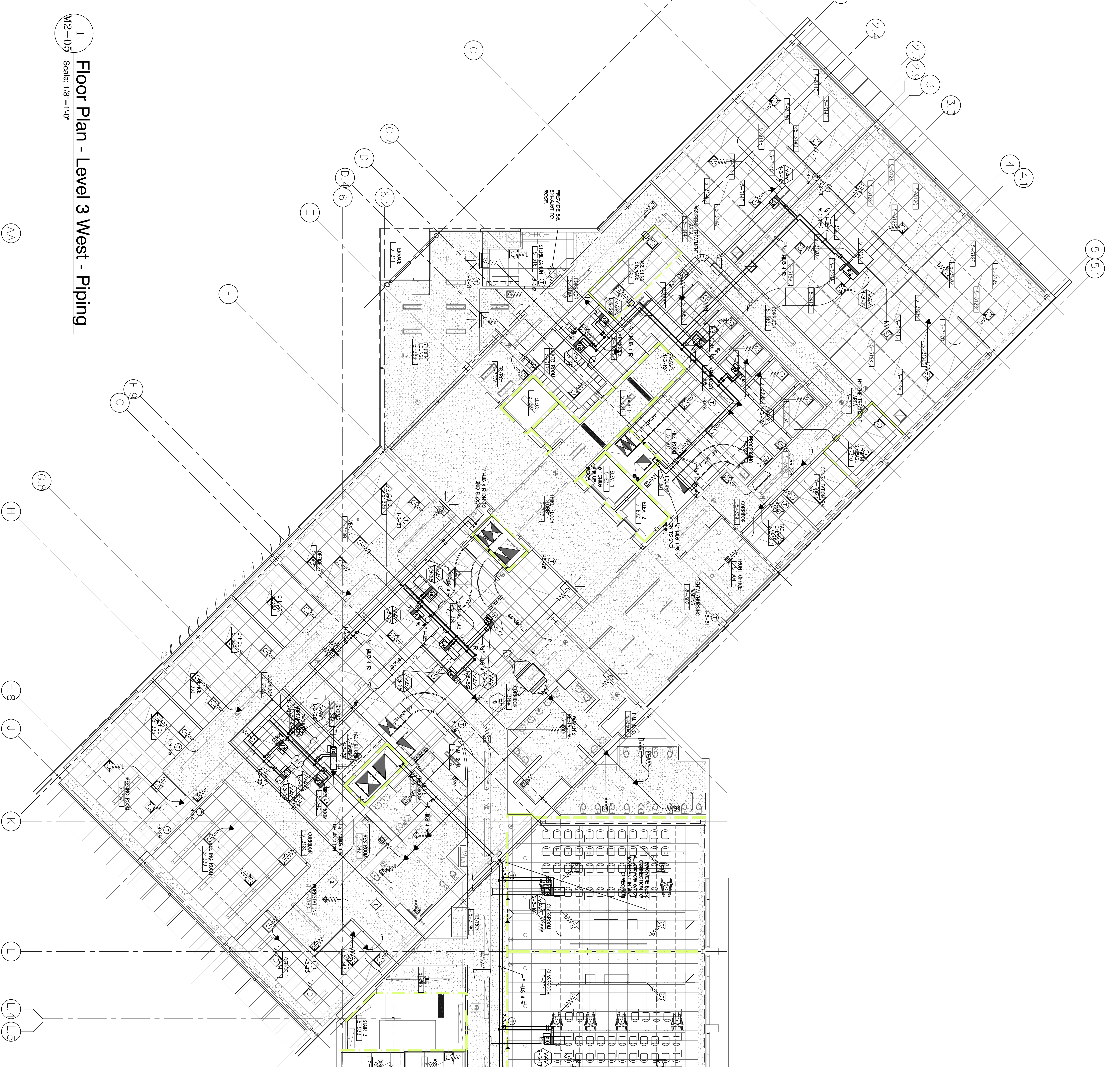
1 Floor Plan - Level 3 West - Piping Scale: 1/8"=1'-0"