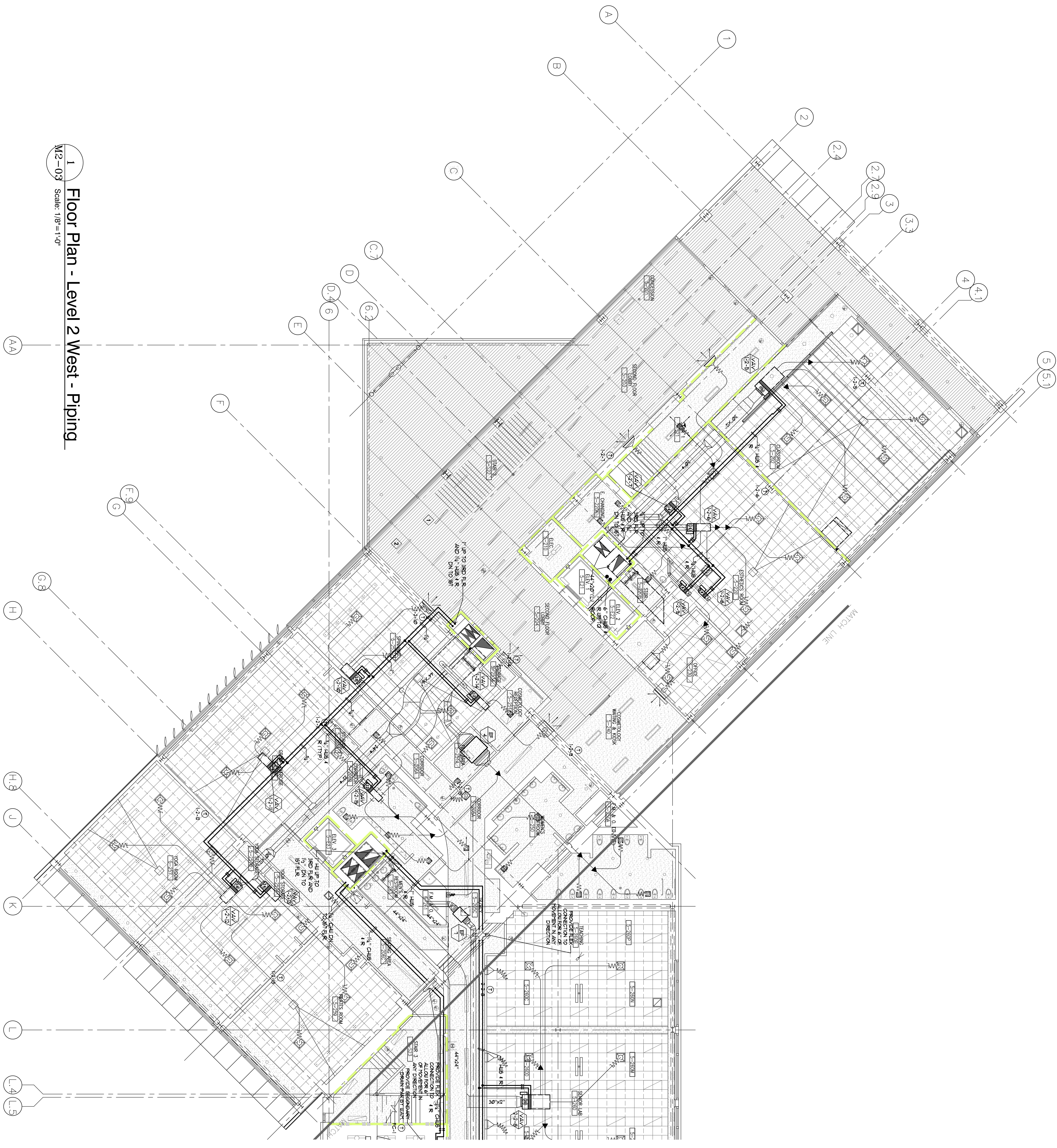
1 Floor Plan - Level 2 West - Piping M2-03 Scale: 1/8"=1'-0"