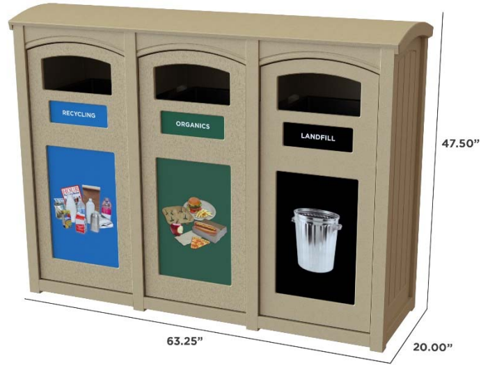
XD35-3 San Mateo Community College District Rev2

*NOTE: Unit colours may vary from render depending on real world lighting conditions*