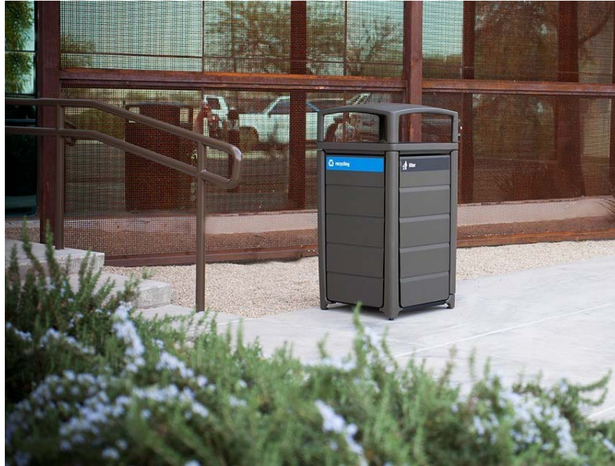
Image from manufacturer, receptacle shown in different color and configuration than specified