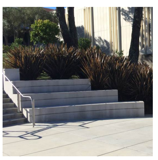
Terraced site walls and seatwall by Building 7