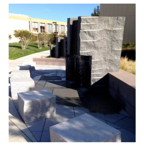
Academy Black granite water feature with Sierra White granite seat pads