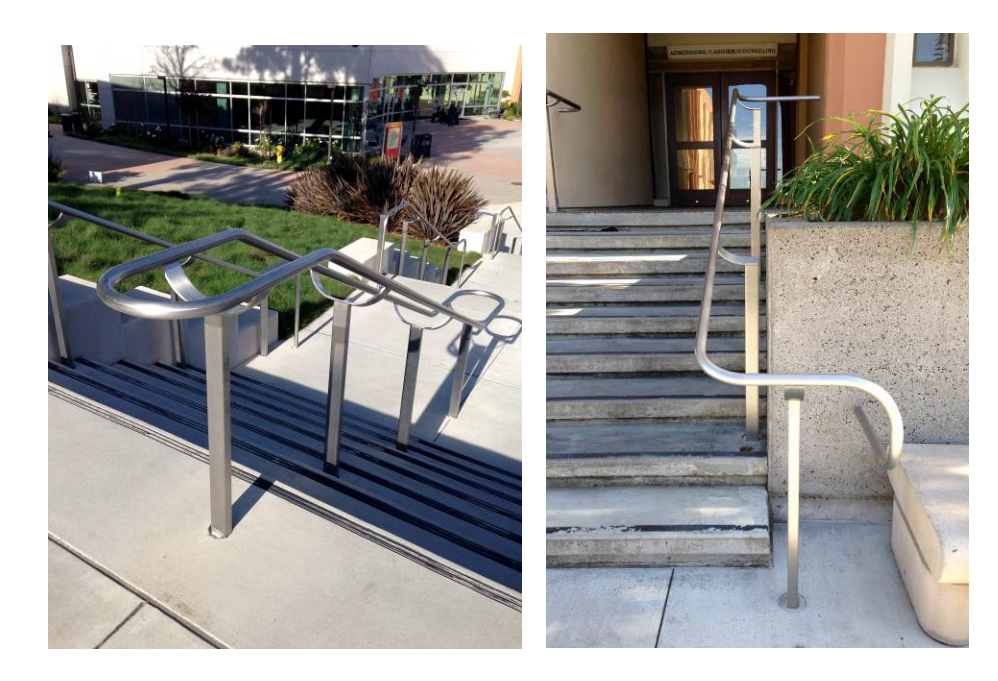
4. Detail example: