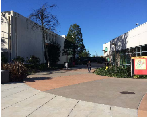
Solomon Taupe paving with Solomon Old Gold bands