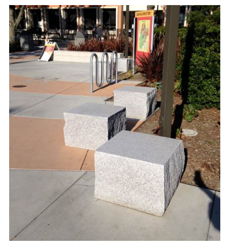
Sierra White granite seat pads