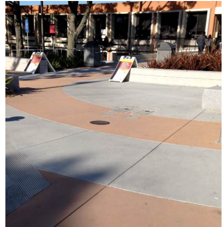
Natural gray concrete with bands of Solomon Old Gold concrete behind Building 8