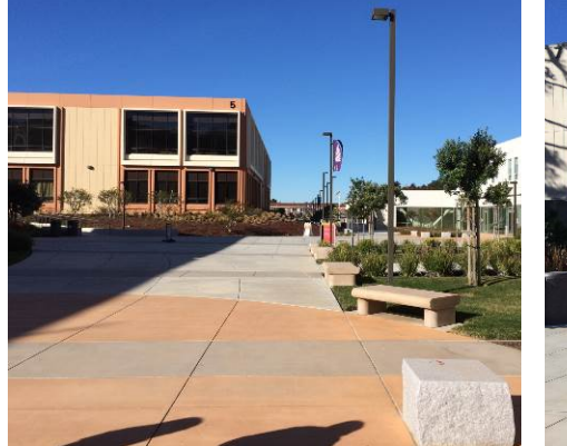
Solomon Old Gold circle with Solomon Taupe bands