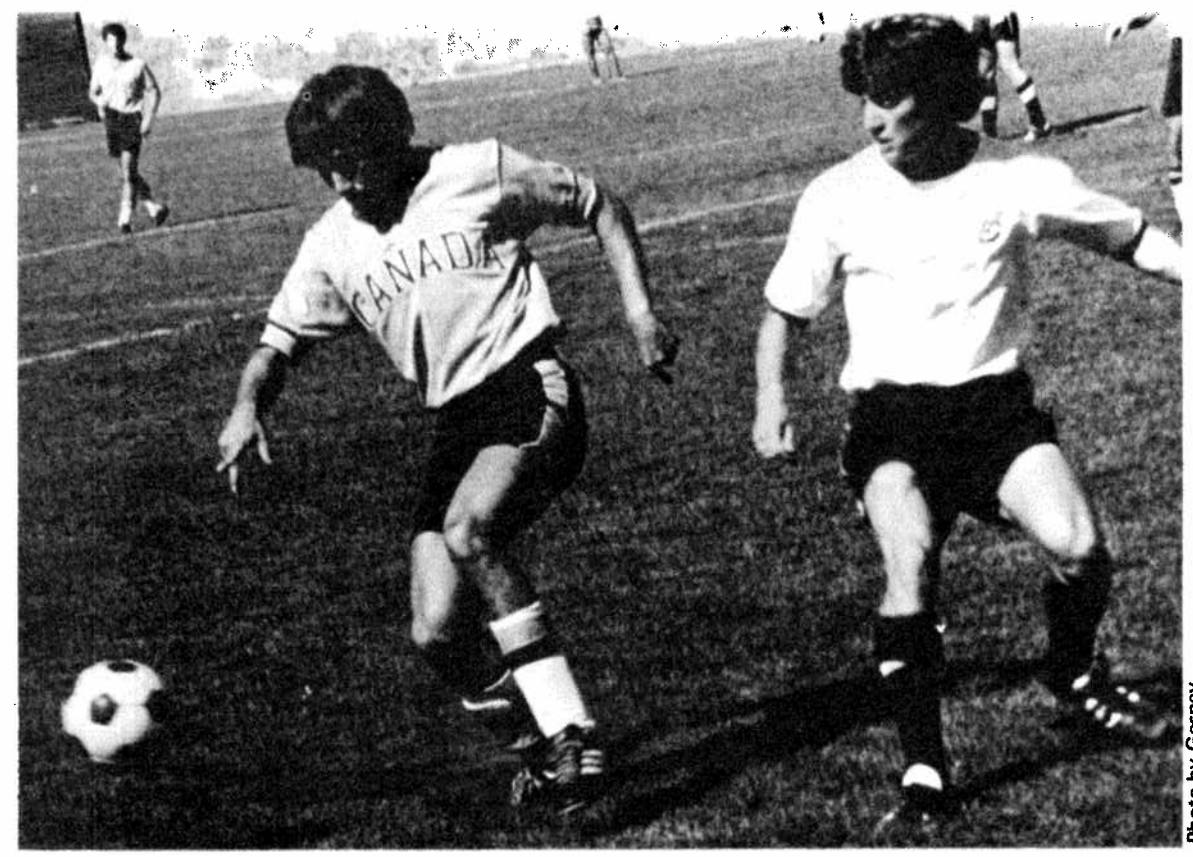
An unidentified Canada player maneuvers around a Diablo Valley opponent. The Colts, all their goals coming in the first quarter, won the game, 4-1.