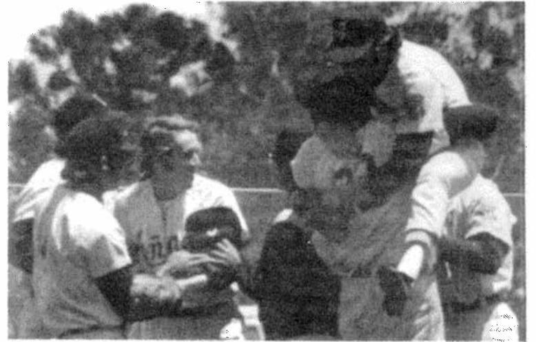
AND WE'RE STATE CHAMPS!

three series 6-1 and 5-3 atop sky high Cañada Mountain.