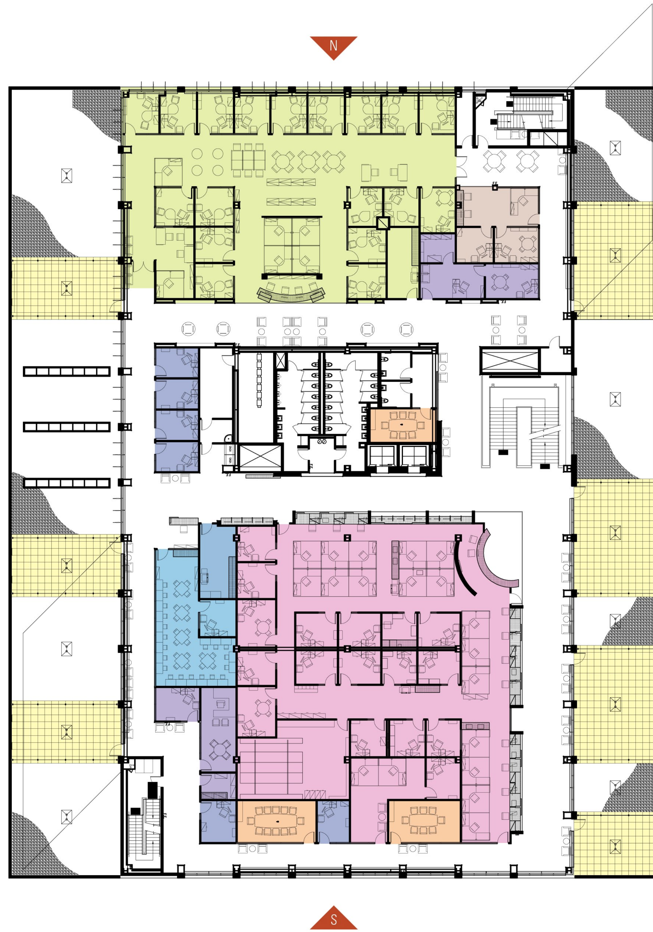
03 Floor Plan - Level 3 Scale 1/16"=1'-0"