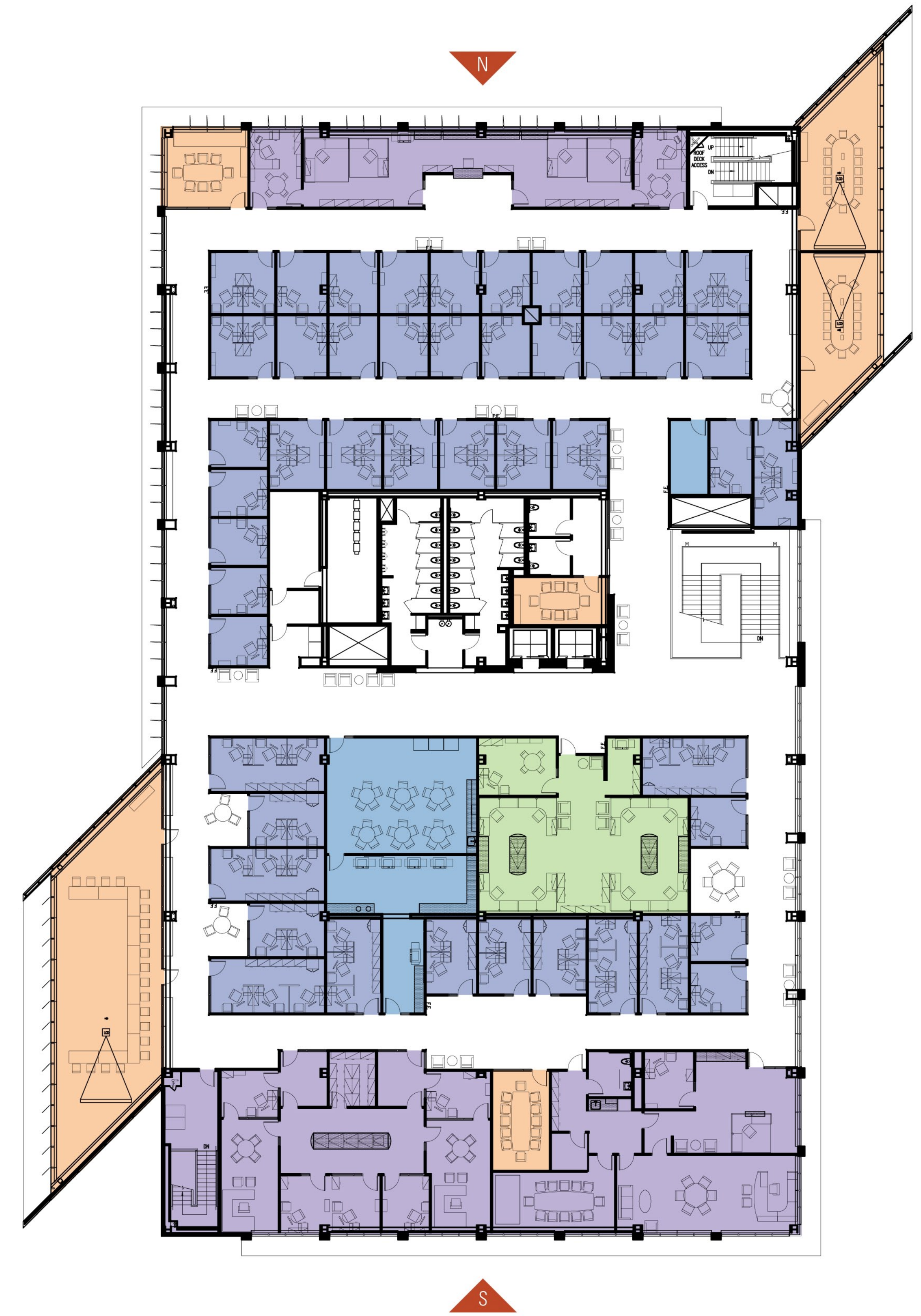
04 Floor Plan - Level 4 Scale 1/16"=1'-0"