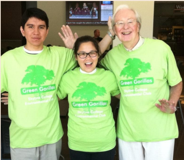
Results- Green Gorillas