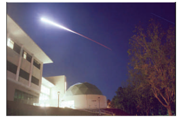
Total Lunar Eclipse – August 2007 Shot over a two hour time frame

Recovery efforts were completed this past weekend in time to welcome back students to a fully functioning planetarium. College of San Mateo is proud to report their hybrid system is the only one of its kind in the United States.