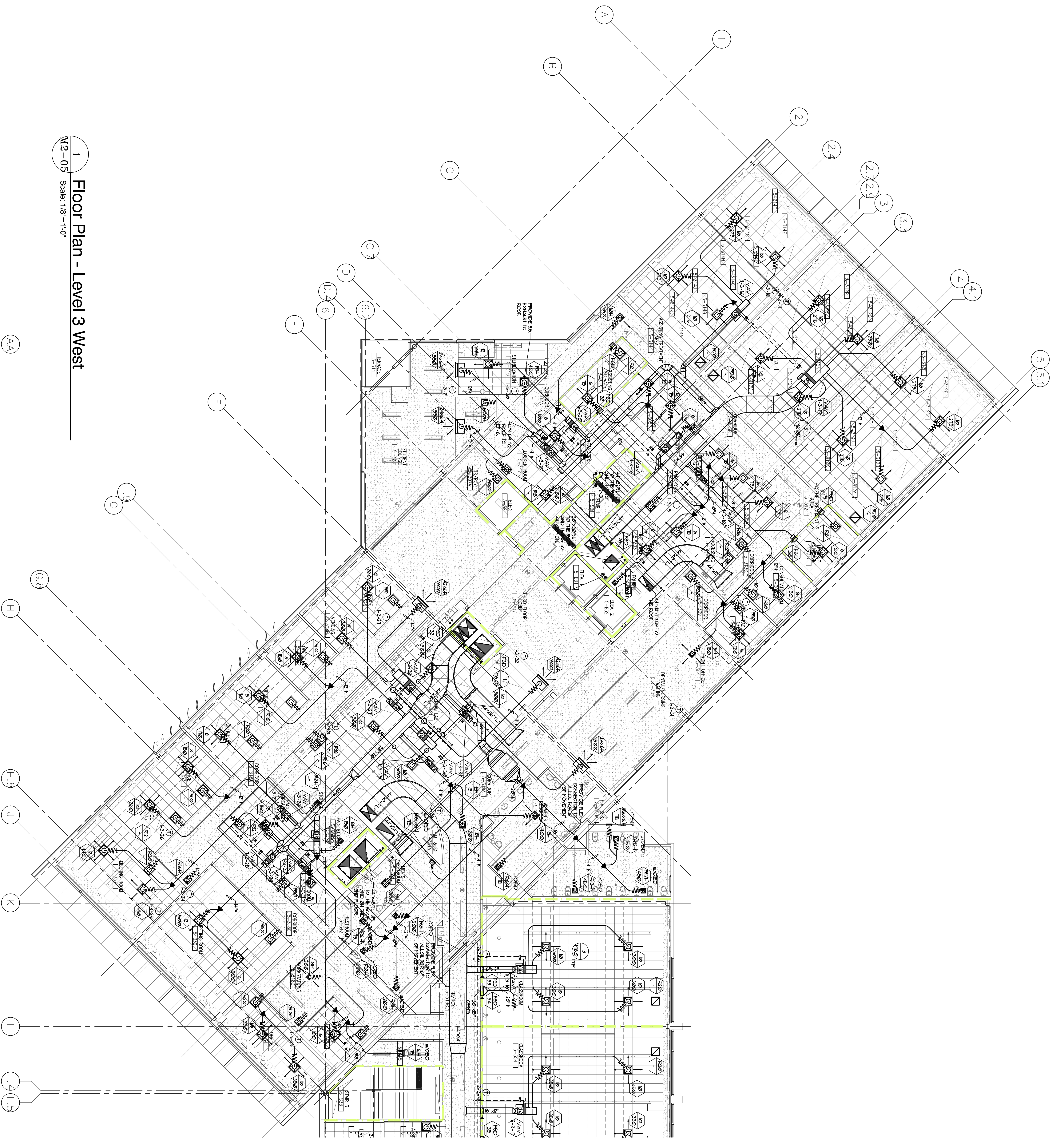
1 Floor Plan - Level 3 West Scale: 1/8"=1'-0"