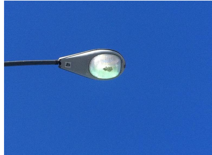
Existing Cobra (Metal Halide)