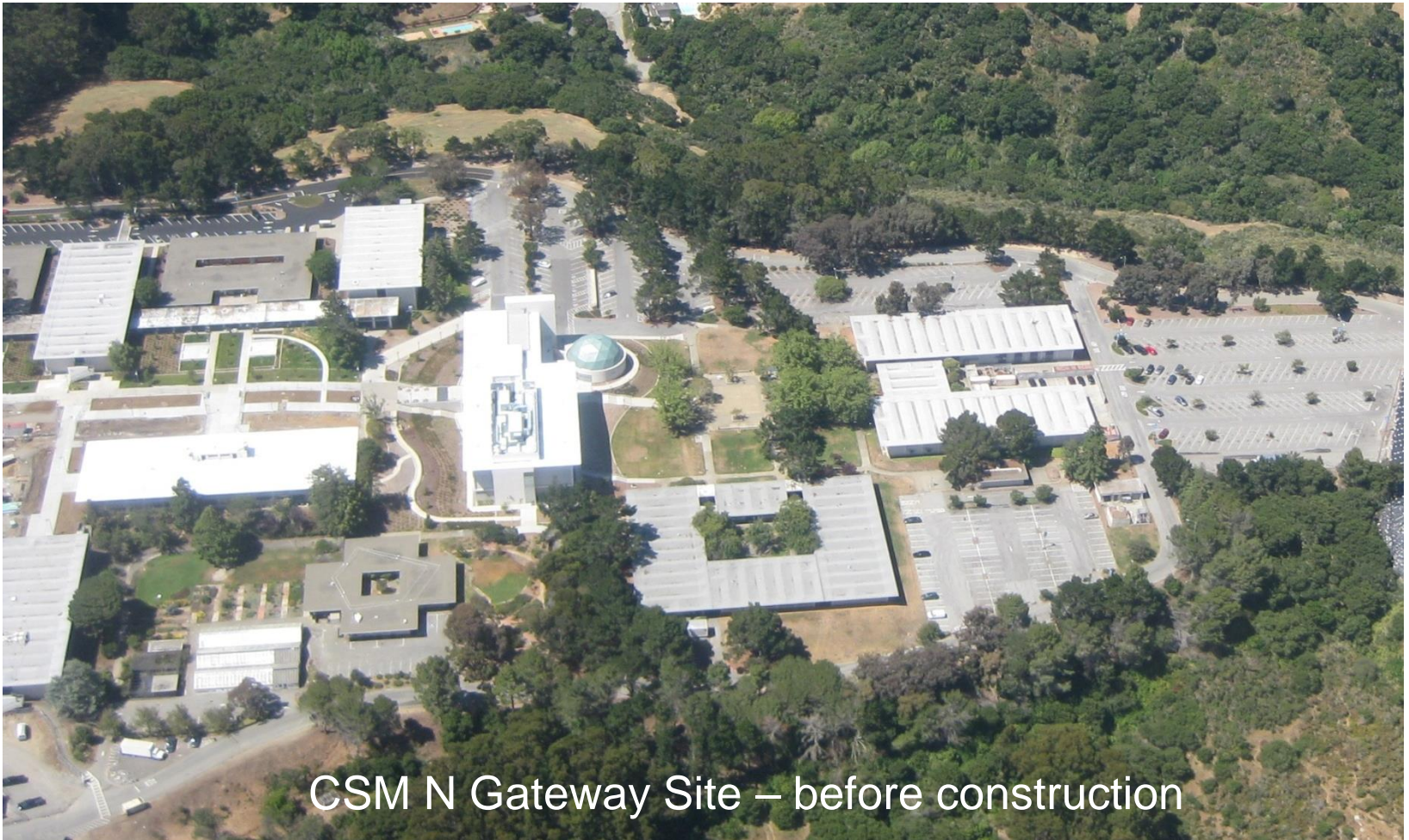
CSM N Gateway Site – before construction