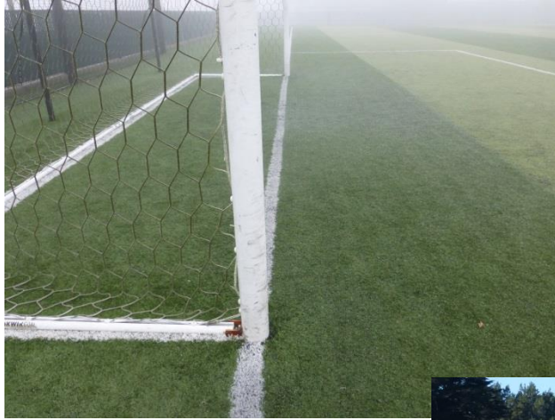
Migrating goal lines (former field)