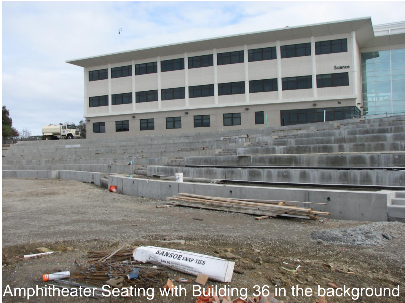
Amphitheater Seating with Building 36 in the background