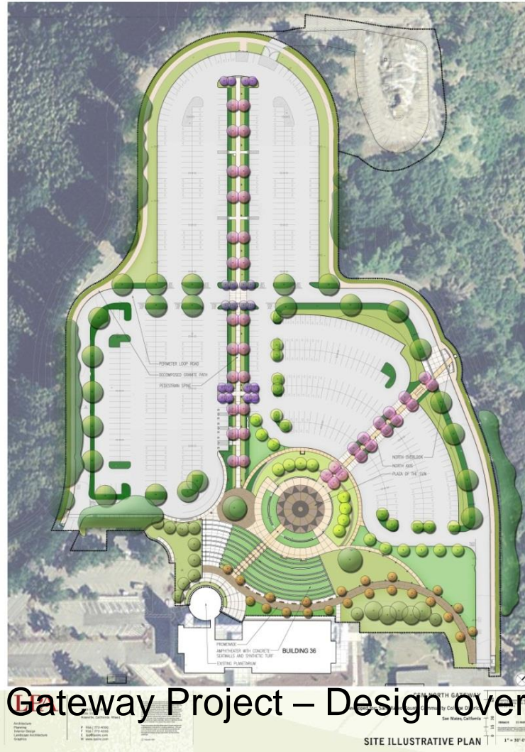
CSM North Gateway Project – Design overview