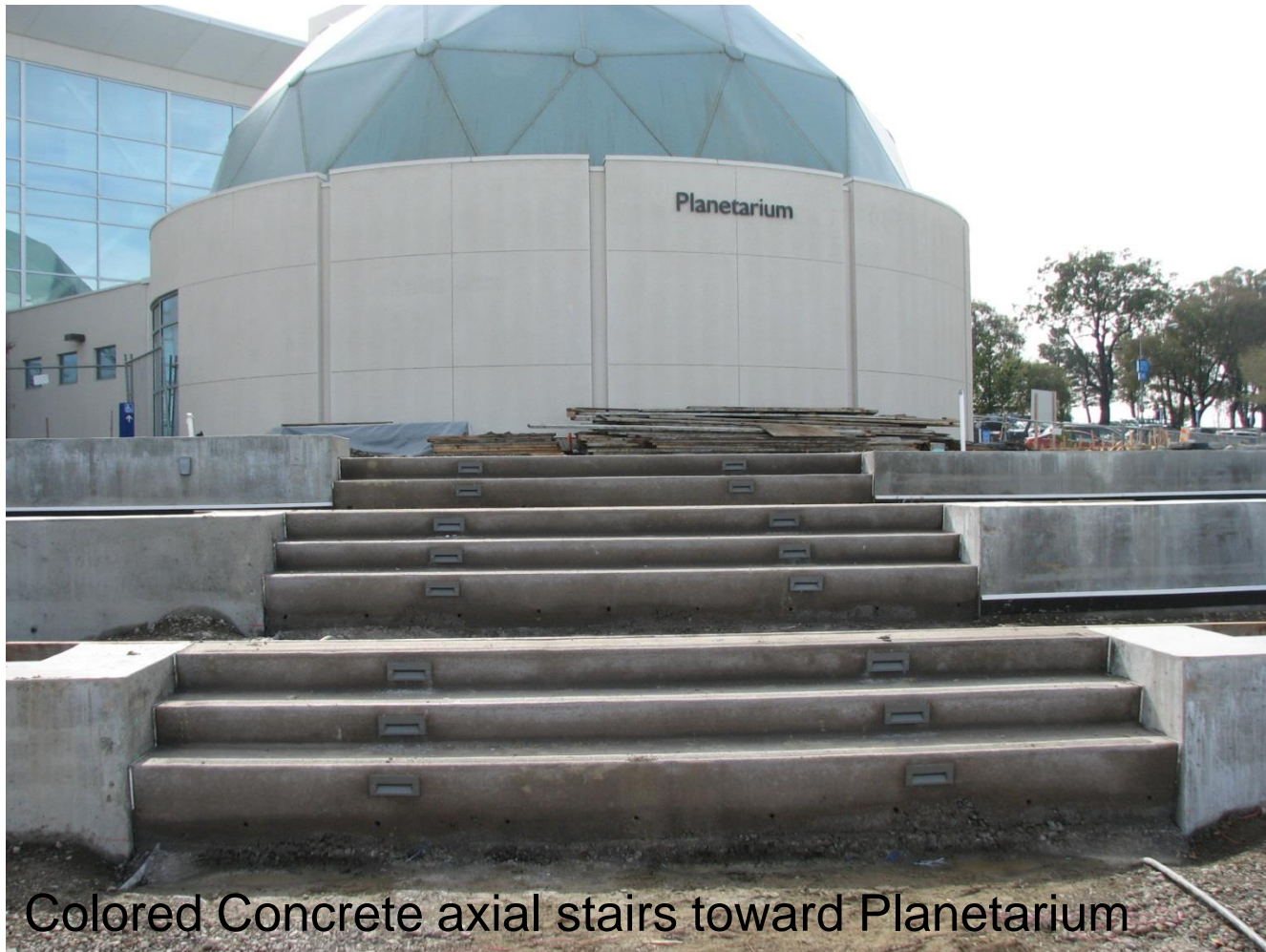
Colored Concrete axial stairs toward Planetarium