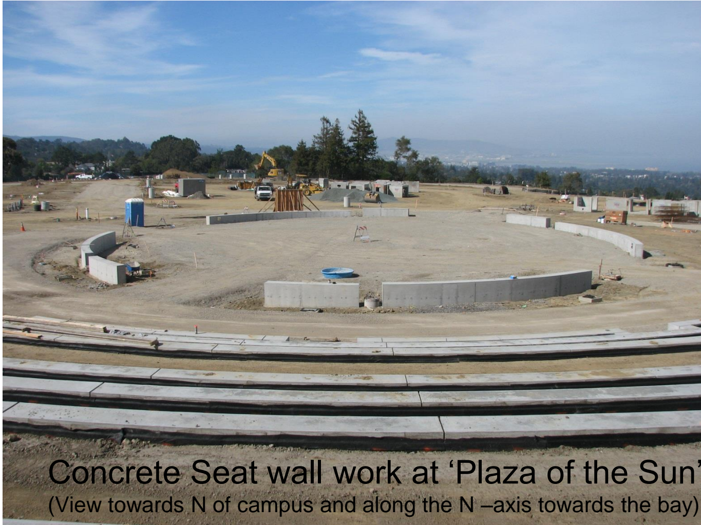
Concrete Seat wall work at 'Plaza of the Sun' (View towards N of campus and along the N-axis towards the bay)