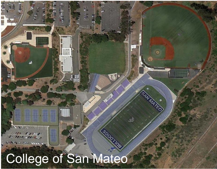
College of San Mateo