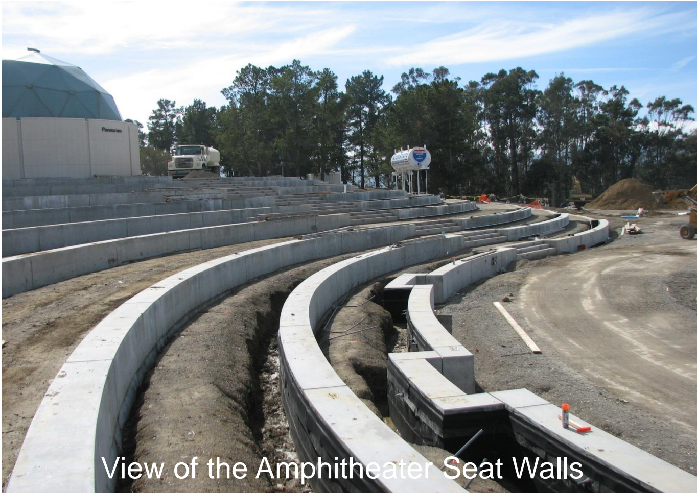
View of the Amphitheater Seat Walls