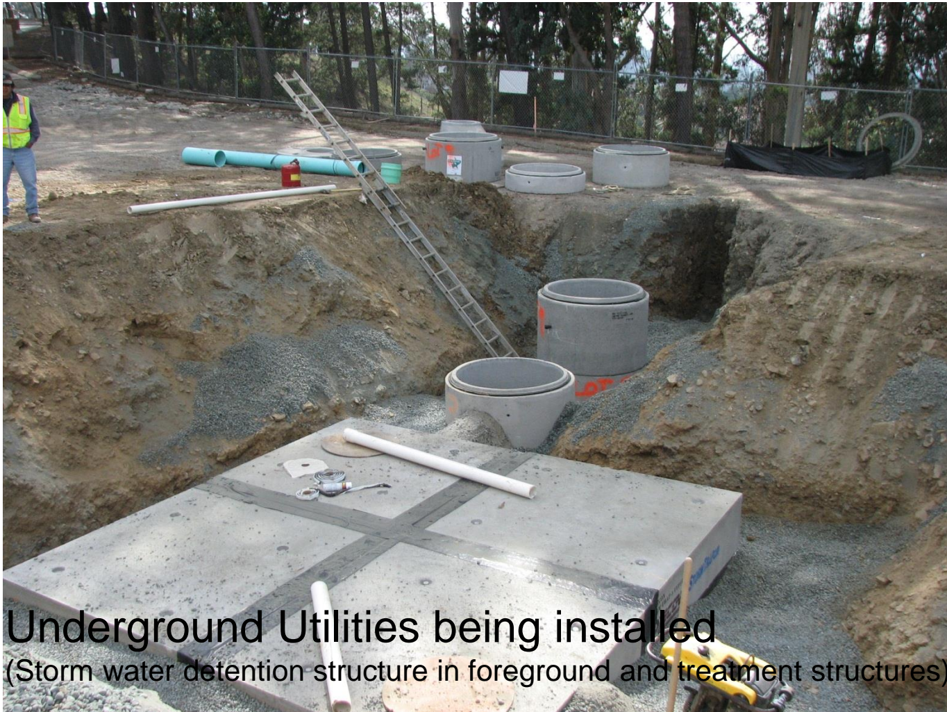
Underground Utilities being installed (Storm water detention structure in foreground and treatment structures)