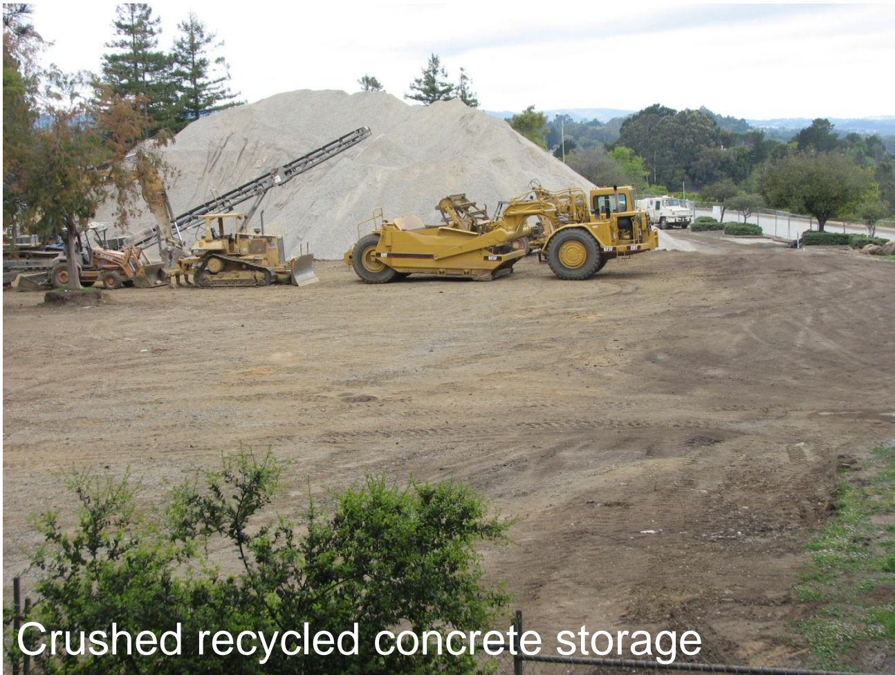
Crushed recycled concrete storage