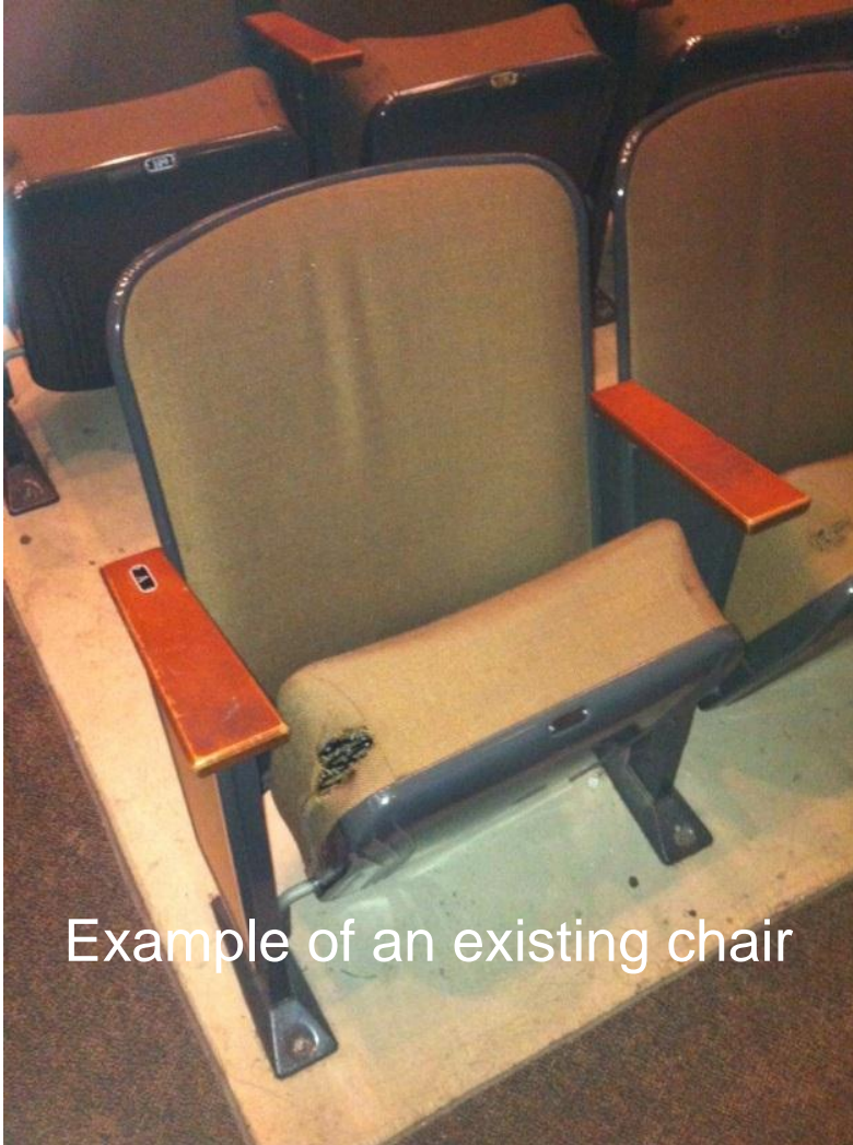
Example of an existing chair