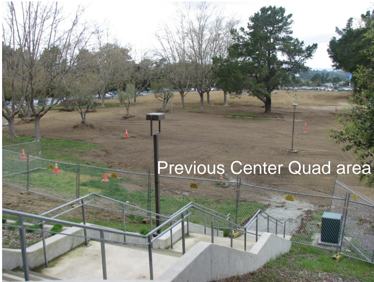
Previous Center Quad area