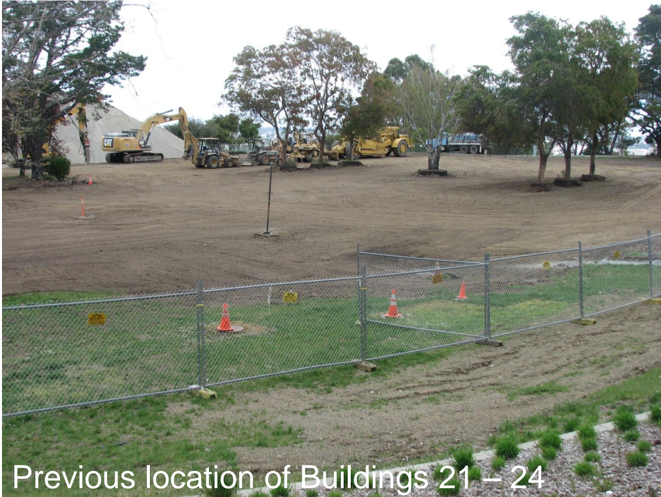
Previous location of Buildings 21 – 24