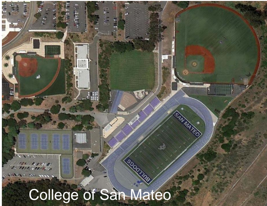
College of San Mateo