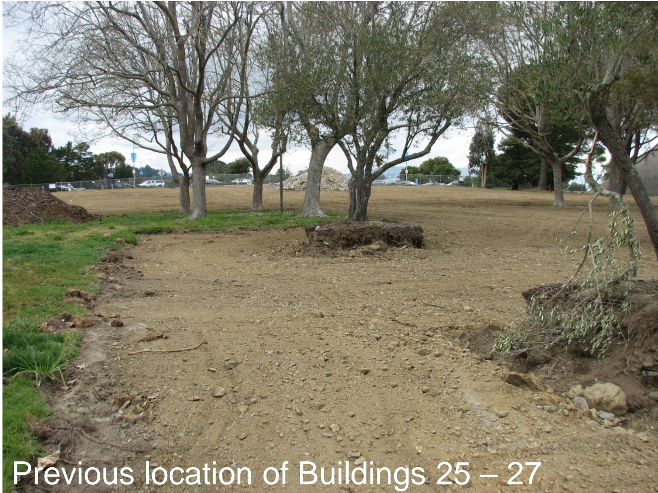
Previous location of Buildings 25 – 27