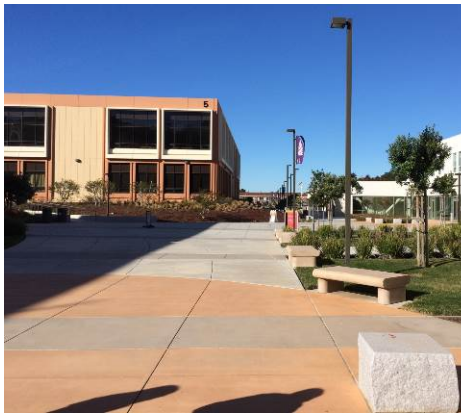
Solomon Old Gold circle with Solomon Taupe bands