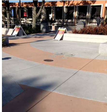
Natural gray concrete with bands of Solomon Old Gold concrete behind Building 8