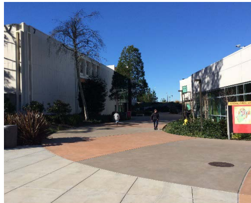
Solomon Taupe paving with Solomon Old Gold bands