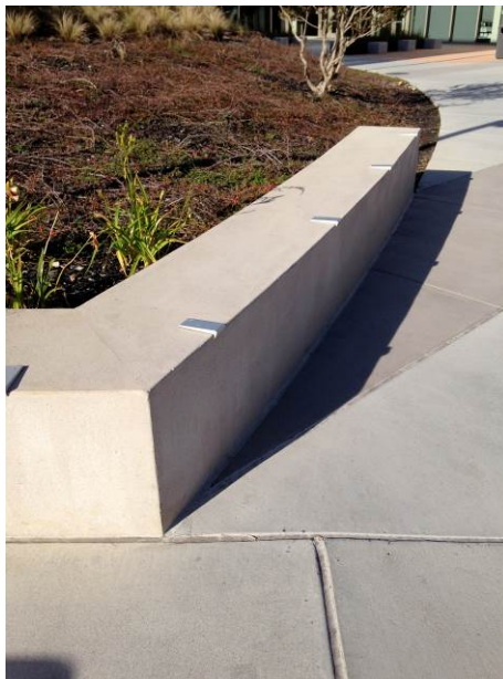
Curved seatwall by Building 5