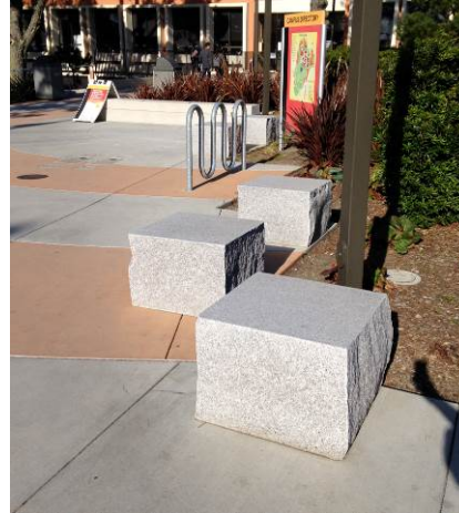
Sierra White granite seat pads