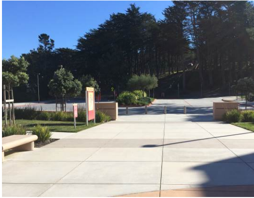
Natural gray concrete with bands of Solomon Taupe concrete between Buildings 2 and 3