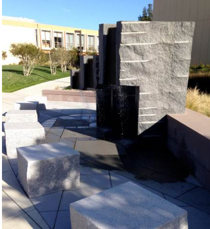
Academy Black granite water feature with Sierra White granite seat pads