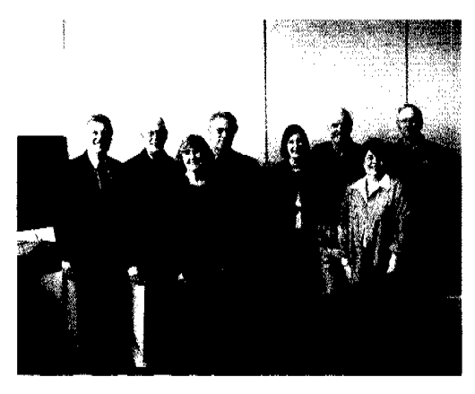
Retiring Faculty Luncheon