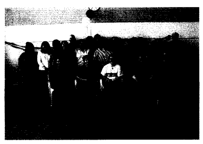
Transition to College Celebrants