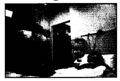
Building 18, Room 205. The 27 Students will later attend the SFSU graduation ceremony.

A special recognition ceremony will be held Friday, May 19 at noon for the first graduating class of students from the Sequoia Hospital/San Francisco State University Baccalaureate Nursing Program at the Cañada College University Center. The ceremony will be held in the nursing lab,