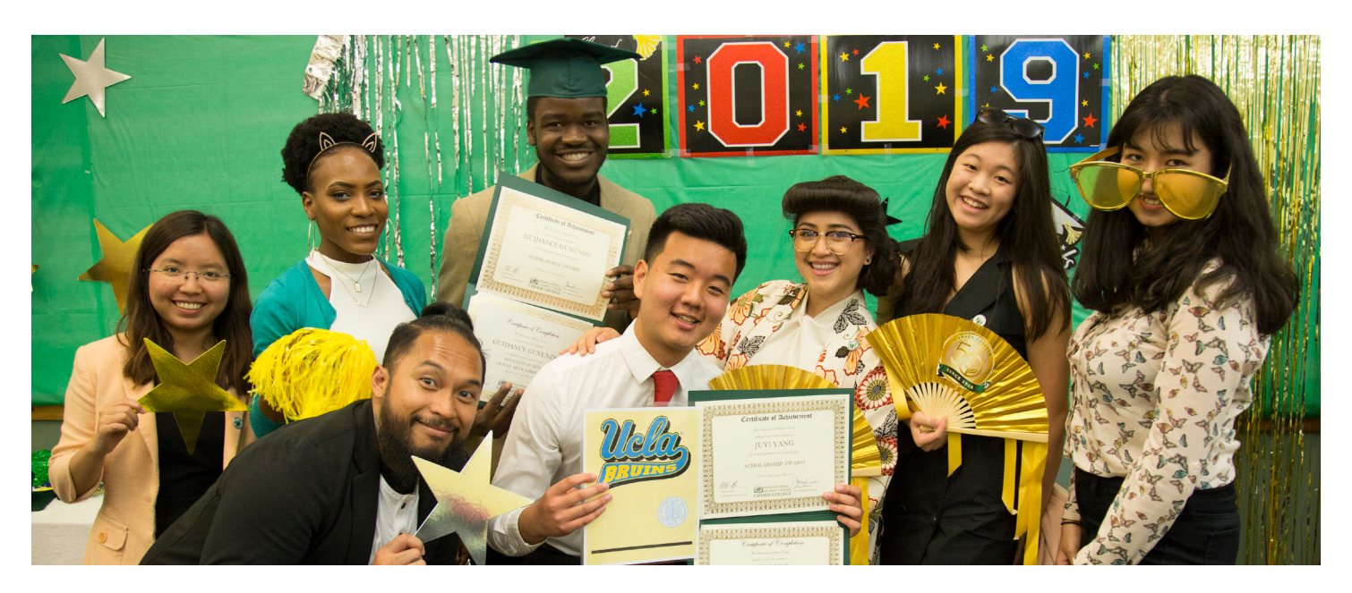
Among 115 California Community Colleges, Cañada College was listed among the highest ranking for International Student Transfer rate into UC Berkeley! In Spring 2018, 42 percent of Cañada College international students who applied to UC Berkeley were accepted. This ranks Cañada College in the top three in California, higher than the California Community College average of 25 percent acceptance. In addition, this Fall, one third of international students transferring from Cañada College will be attending UC Berkeley or UCLA. In total, 60 percent of all Cañada College international student transfers will be heading to a UC this Fall.