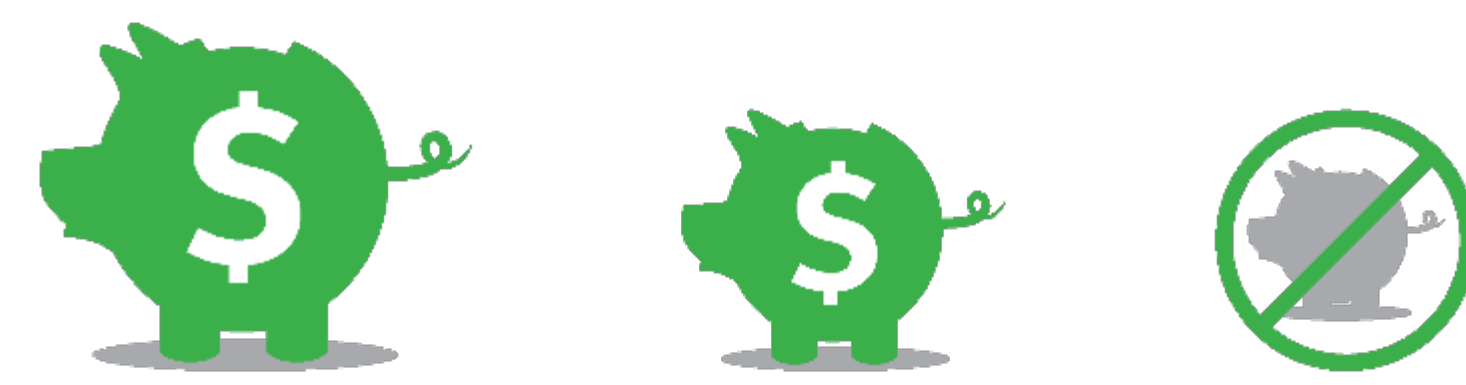
Delta Dental PPO